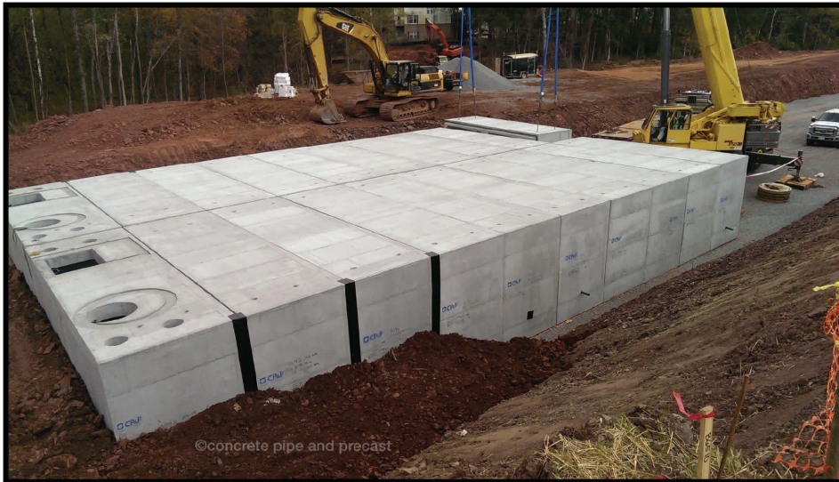
Installation of the Storm Pass Detention System at 20% completion