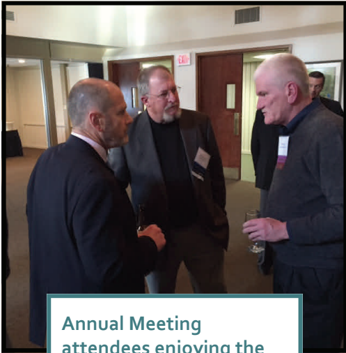
Annual Meeting attendees enjoying the opening reception