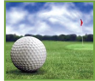
Golf was just one of many highlights of another great Annual Meeting!

Thank you to all the golf hole sponsors (listed on page 3 of this newsletter). Without all the generous support of PCAV member companies, these outings would not be possible! If you did not participate this year, please plan on joining everyone on the golf course in 2016! You won't want to miss out!