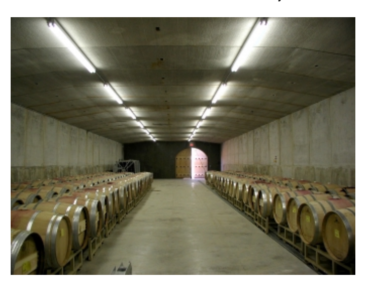
Wine casks line the walls in the new Kluge Estate Winery & Vineyards' storage facility, built with precast concrete by Permatile.

Permatile designers used Hy-Span bridge sections to build the 30'x12'x100' structure. The Hy-Span sections were delivered to the jobsite and installed on